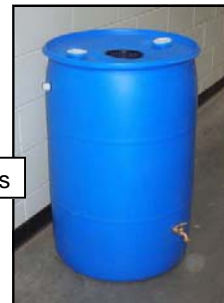
ReUse Center Barrels

Locations: 2801 21st Ave. S. Minneapolis (612-724-2608) 1727 E. Hwy. 36 Maplewood (651-379-1280)