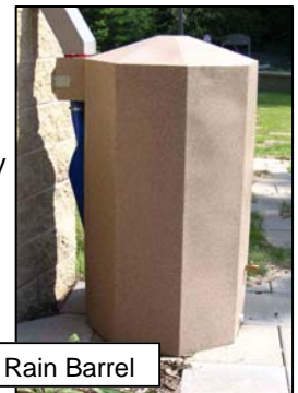
RiverSides Rain Barrel

Website: www.motheearthgarden.com Phone: (612) 724-2296 Address: 3738 42nd Ave. S. Minneapolis, MN 55406