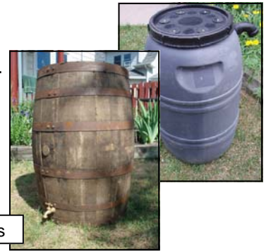
Blue River Rain Barrels