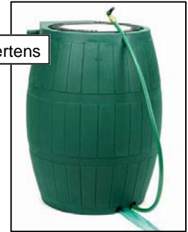
Achla Designs @ Gertens

Website: www.bluerivermn.com Phone: (651) 238-5332 Email: info@blueriverMN.com Address: 1620 Central Ave Suite #158 Minneapolis - Open Saturdays 9am - noon