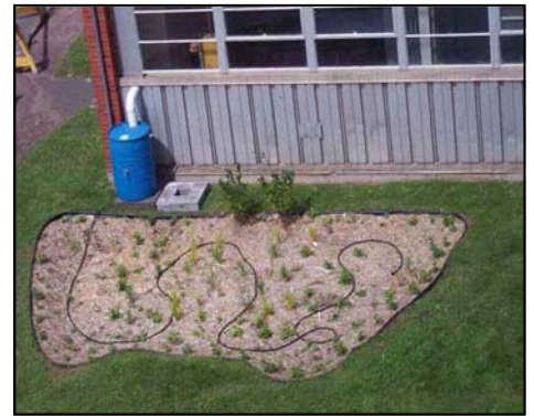
Connecting a soaker hose to your rain barrel is an efficient means of irrigation.

If you do not have the internet, use the underlined words above as key words to research these projects at a local library or to ask us!